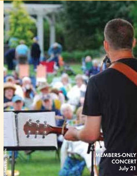
MEMBERS-ONLY CONCERT July 21

Join us for entertainment and fun on the Lawn Garden! Food available for purchase. Visit towerhillbg.org for details.