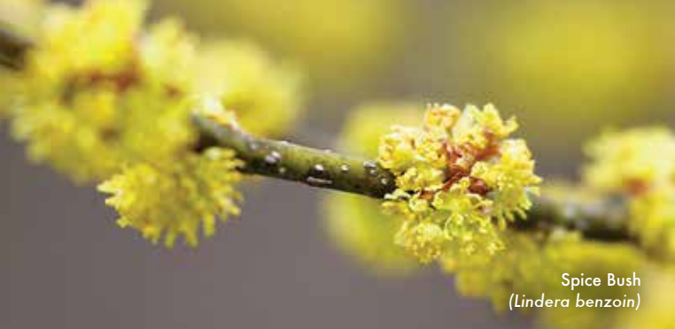
Spice Bush ( Lindera benzoin )