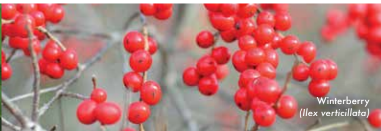
Winterberry ( Ilex verticillata )