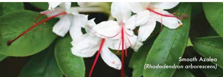
Smooth Azalea ( Rhododendron arborescens )

Sweetbay Magnolia ( Magnolia virginiana ) Fragrant flowers open in early summer, followed by clusters of red fruit. Eastern Towhees, Vireos, deer, and squirrel seek the fruit.