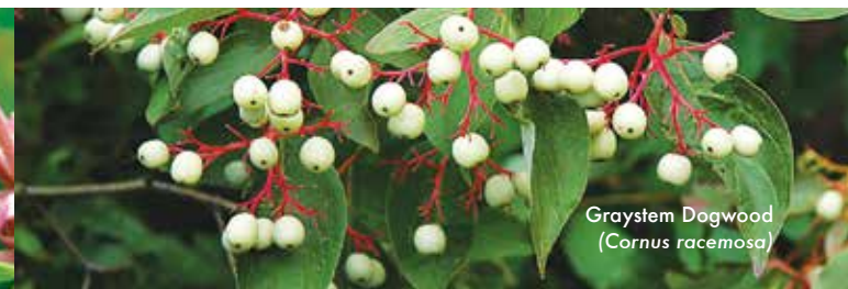
Graystem Dogwood ( Cornus racemosa )