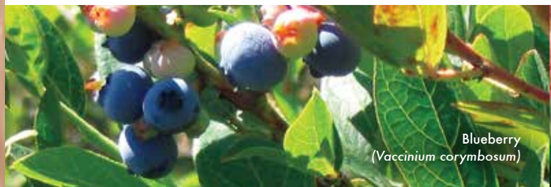
Blueberry ( Vaccinium corymbosum )