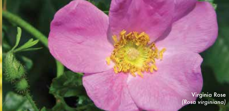
Virginia Rose ( Rosa virginiana )