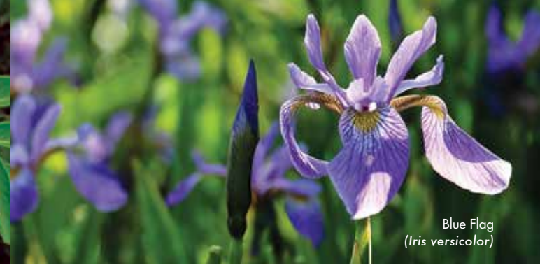
Blue Flag ( Iris versicolor )