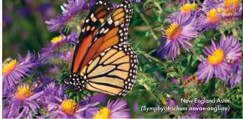
New England Aster ( Symphyotrichum novae-angliae )

Plants that naturally occur in moist soils throughout the northeast surround the Hope H. Spear Wildlife Refuge Pond. Many of the varieties of trees, shrubs, and herbaceous plants seen here provide nourishment, cover, and nesting material for wildlife. Tower Hill selected these plants for their adaptability to such sites, as well as for their value to wildlife, such as birds, insects, mammals, fish, and frogs.