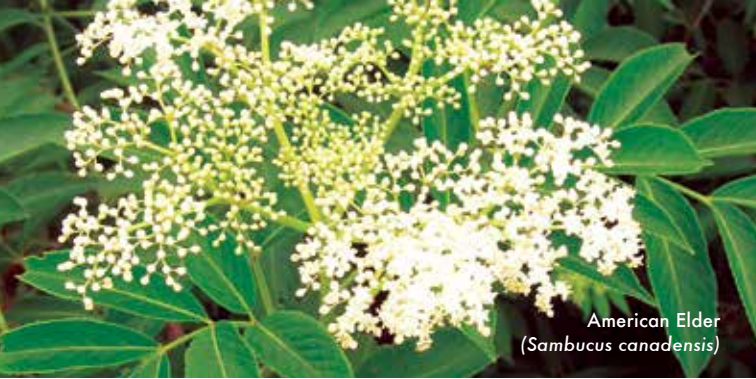
American Elder ( Sambucus canadensis )