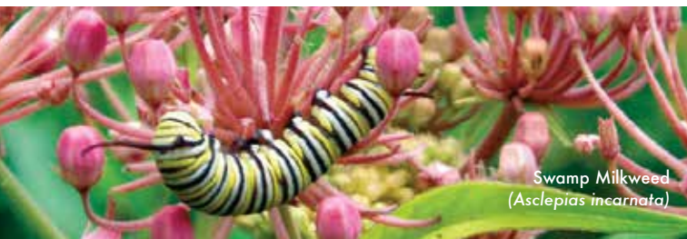
Swamp Milkweed ( Asclepias incarnata )