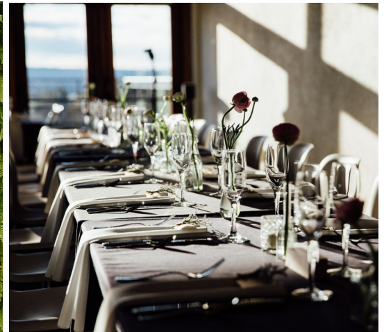
Addie Roberge Photography