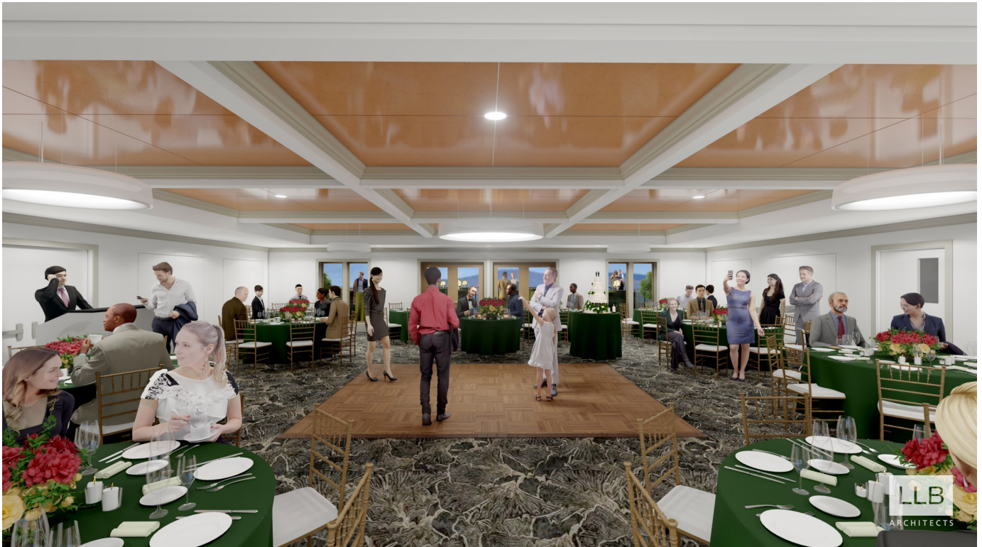
Rendering of the Reservoir Room

Reservoir Room — A brand new space for summer 2024, the Reservoir Room offers a naturally lit room adorned with elegant copper ceiling details. Floor to ceiling doors and windows lead out onto a terrace with stunning views of the Wachusett Reservoir. The space can host a reception for up to 80 guests. A loop hearing system integrated into the room makes this a beautiful and accessible space for your guests.