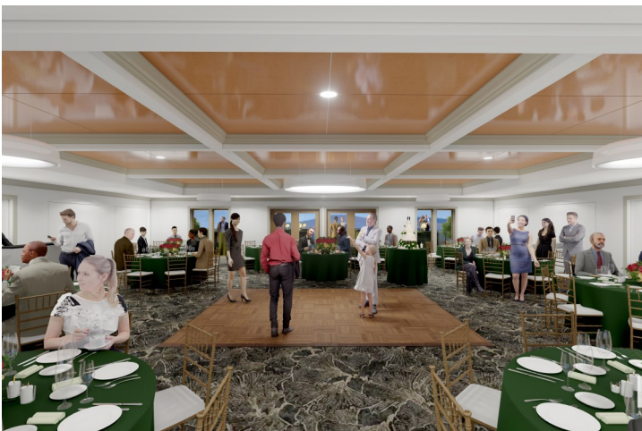
Rendering of the Reservoir Room

Reservoir Room – A brand new space for summer 2024, the Reservoir Room offers a naturally lit room with floor-to-ceiling windows and a ceiling adorned with elegant copper details. Glass doors lead out onto a terrace with stunning views of the Wachusett Reservoir. A loop hearing system integrated into the room makes this an accessible space for guests. This room also serves as the inclement weather backup location for both ceremonies and cocktail hours planned outdoors.