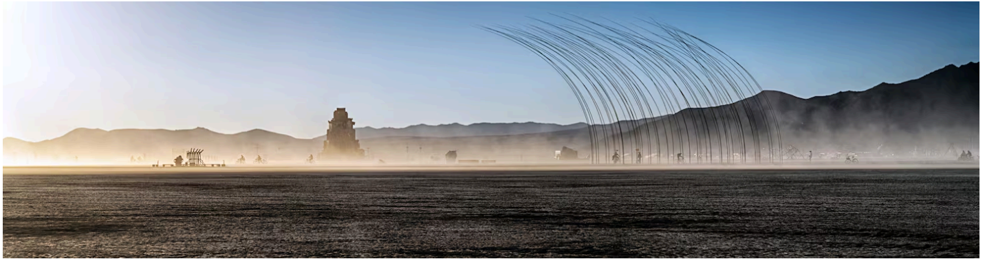
"Vanishing Points" by Patrick Shearn of Poetic Kinetics, at Burning Man 2023.

“They look like they go straight up into the clouds.”