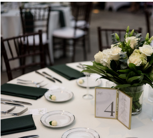
Gina Brocker Photo

Final Payment: The final payment will be comprised of the remaining venue fee plus a 6.25% MA sales tax and is due 30 days prior to your wedding.