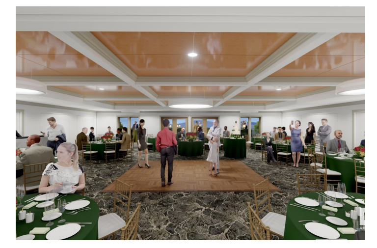
Rendering of the Reservoir Room

Reservoir Room – A brand new space built in 2024, the Reservoir Room offers a naturally lit room with floor-to-ceiling windows and a ceiling adorned with elegant copper details. Glass doors lead out onto a terrace with stunning views of the Wachusett Reservoir. A loop hearing system integrated into the room makes this an accessible space for guests. This room can serve as the Inclement weather backup location for either ceremony or cocktail hour.