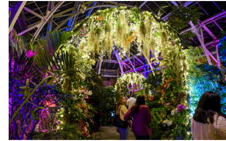
Orchids After Dark

*General admission passes may not be redeemed for public ticketed events including but not limited to Night Lights, Orchids After Dark etc.