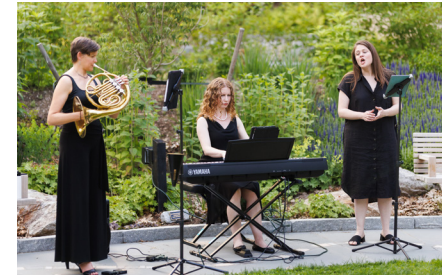
Music in Bloom – Photo by James Jones

*General admission passes may not be redeemed for public ticketed events including but not limited to Night Lights, Orchids After Dark etc.