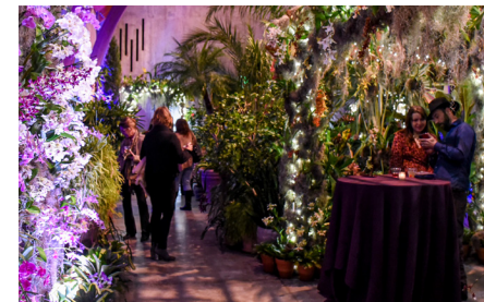
Orchids After Dark