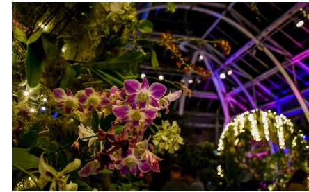
Orchids After Dark