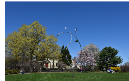
George Sherwood Exhibit