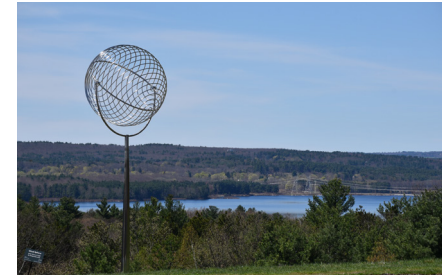
George Sherwood Exhibit