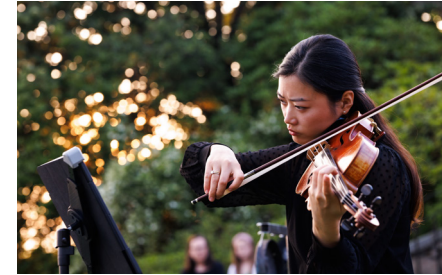
Music in Bloom