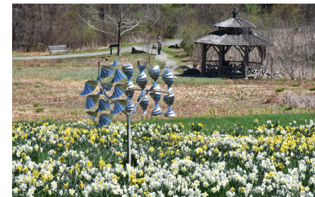
George Sherwood Exhibit