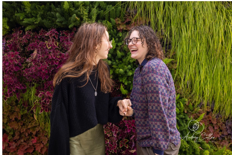
Audrey Cutler Photography