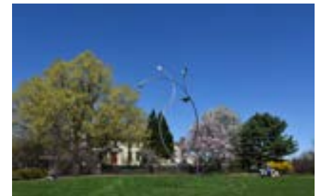
George Sherwood Exhibit