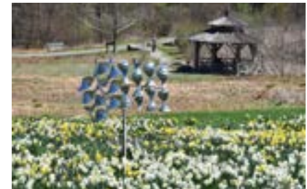
George Sherwood Exhibit