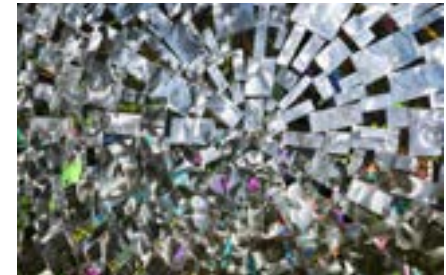
George Sherwood Exhibit