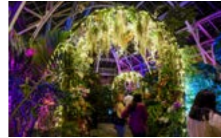
Orchids After Dark

*General admission passes may not be redeemed for public ticketed events including but not limited to Night Lights, Orchids After Dark etc.