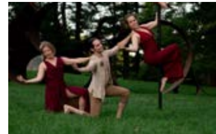
Arias Aloft: Midsummer Magic