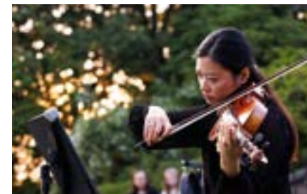
Music in Bloom