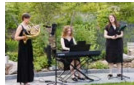
Music in Bloom

*General admission passes may not be redeemed for public ticketed events including but not limited to Night Lights, Orchids After Dark etc.