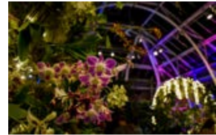
Orchids After Dark