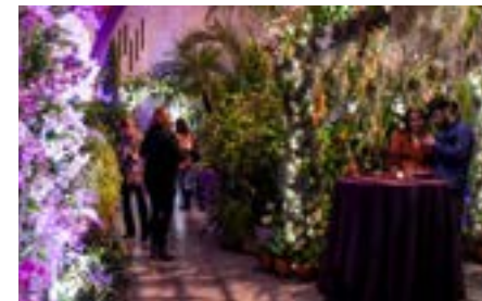
Orchids After Dark