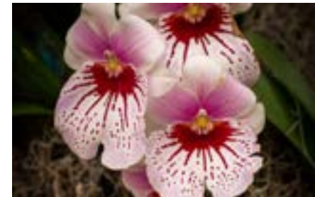
Orchids After Dark