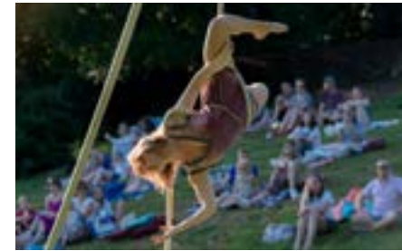
Arias Aloft: Midsummer Magic