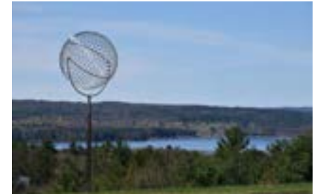
George Sherwood Exhibit