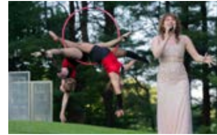
Arias Aloft: Midsummer Magic

*General admission passes may not be redeemed for public ticketed events including but not limited to Night Lights, Orchids After Dark etc.