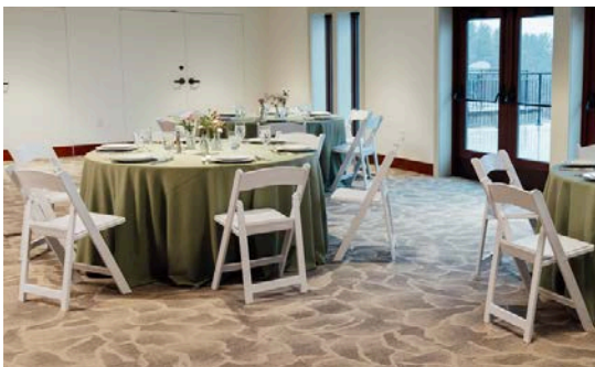
White Garden Chairs