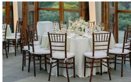
Fruitwood Chiavari Chairs