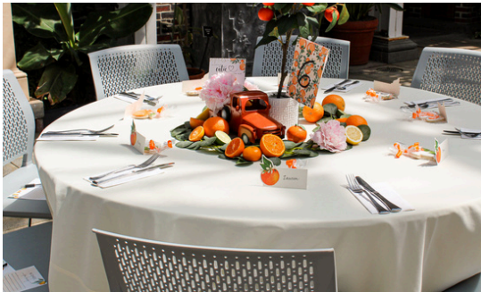
Standard Grey Conference Chairs

$100 for up to 25 chairs, $200 for 26-50, $300 for 51-80, $400 for 81-120.