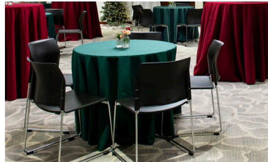
Standard Black Conference Chairs