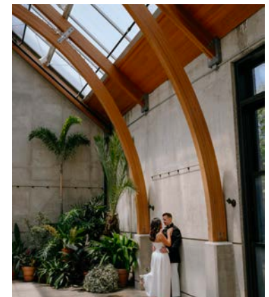
Jaden Nadya Photography